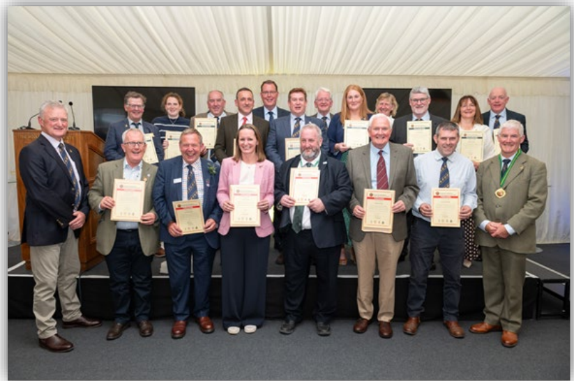
2024 CARAS Award Presentation